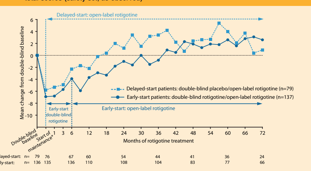
Figure 2. All patients from SP702 study: mean change from double-blind baseline in UPDRS II+III total scores (safety set, as observed)

*For <u>early-start patients</u>: rotigotine maintenance starts after double-blind titration; <u>delayed-start patients</u>: rotigotine maintenance starts after open-label titration